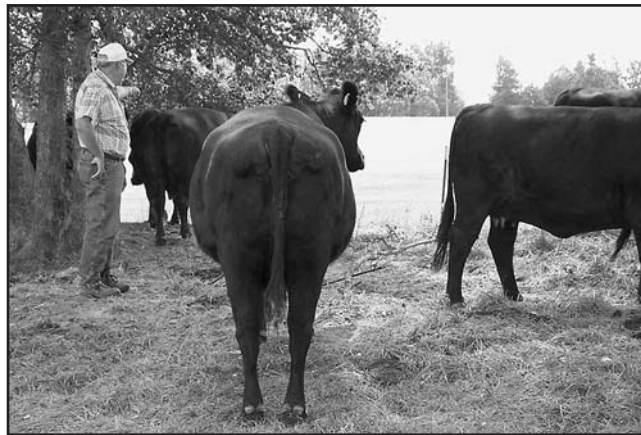
Figure 1. Beef cattle producer body condition scoring a herd at pasture.

Two animals with the same body condition score may have dramatically different live weights. Similarly, cattle with the same live weight may have distinctly different body condition scores. Weight differences between condition scores vary depending on the score and where the animal is in the production cycle. These weight differences often range from 70 to 140 pounds. Percentage body fat associated with each distinct body condition score appears in Table 1 .