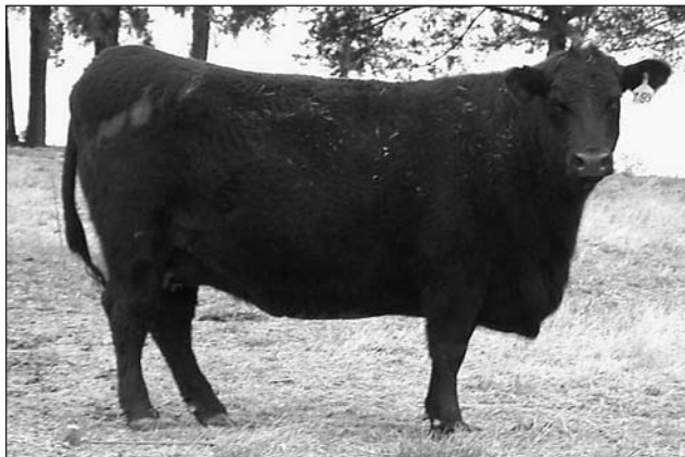
Figure 3. Body condition scores and descriptions for beef cattle.

The overall appearance is blocky with extremely wasty and patchy fat cover. The tailhead and hooks are buried in fatty tissue with fat pones protruding. Bone structure is no longer visible and barely palpable. Large fatty deposits may even impair animal mobility.